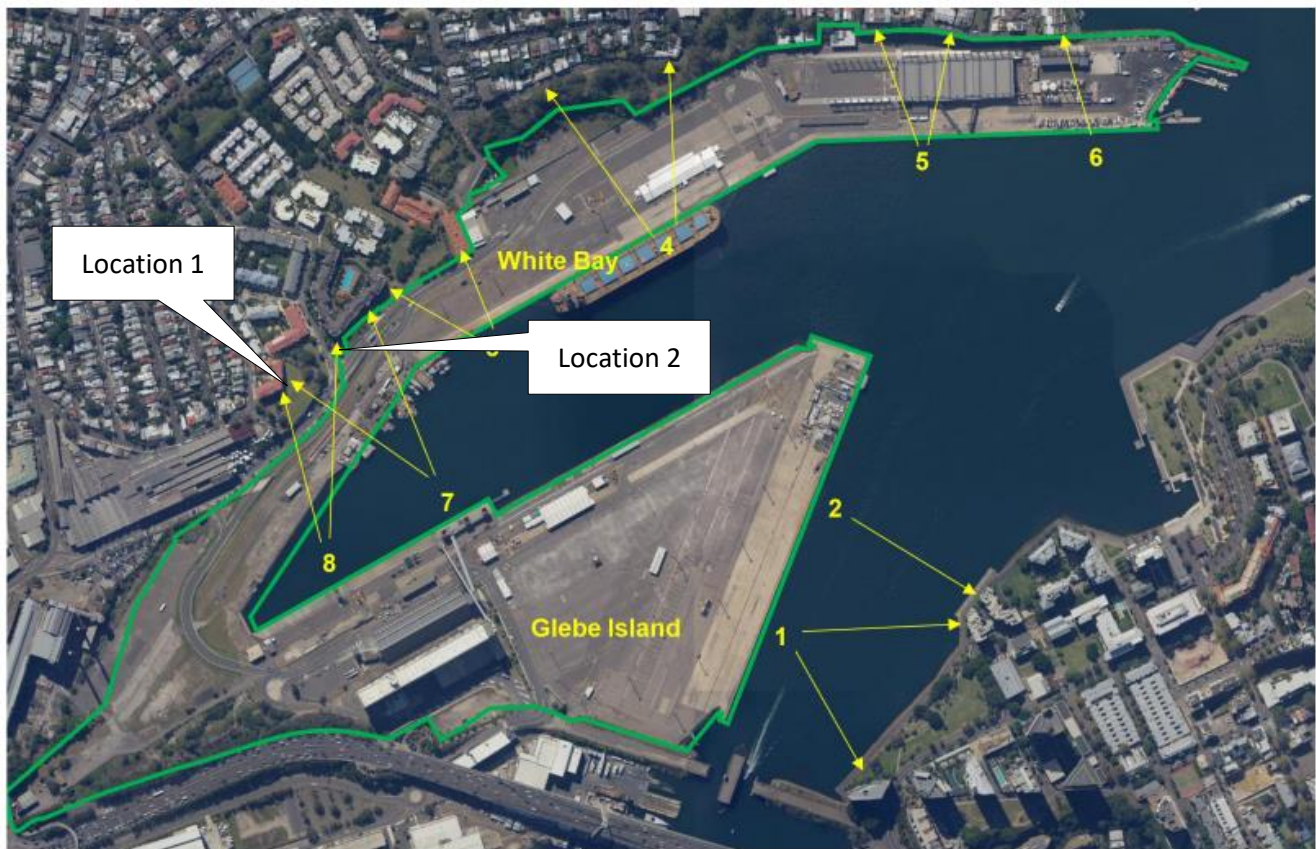
Figure 1 Location of berths and nearest receivers to each berth

Note: Figure referenced from Appendix H of the Port Noise Policy