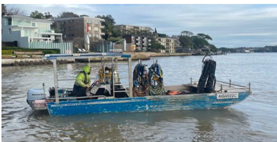
Vessel Party Punt , UVI 448963 will be used for waterside inspections.

Mariners navigating in the vicinity are requested to proceed with caution and remain alert to inspection vessel movements and diver activity.