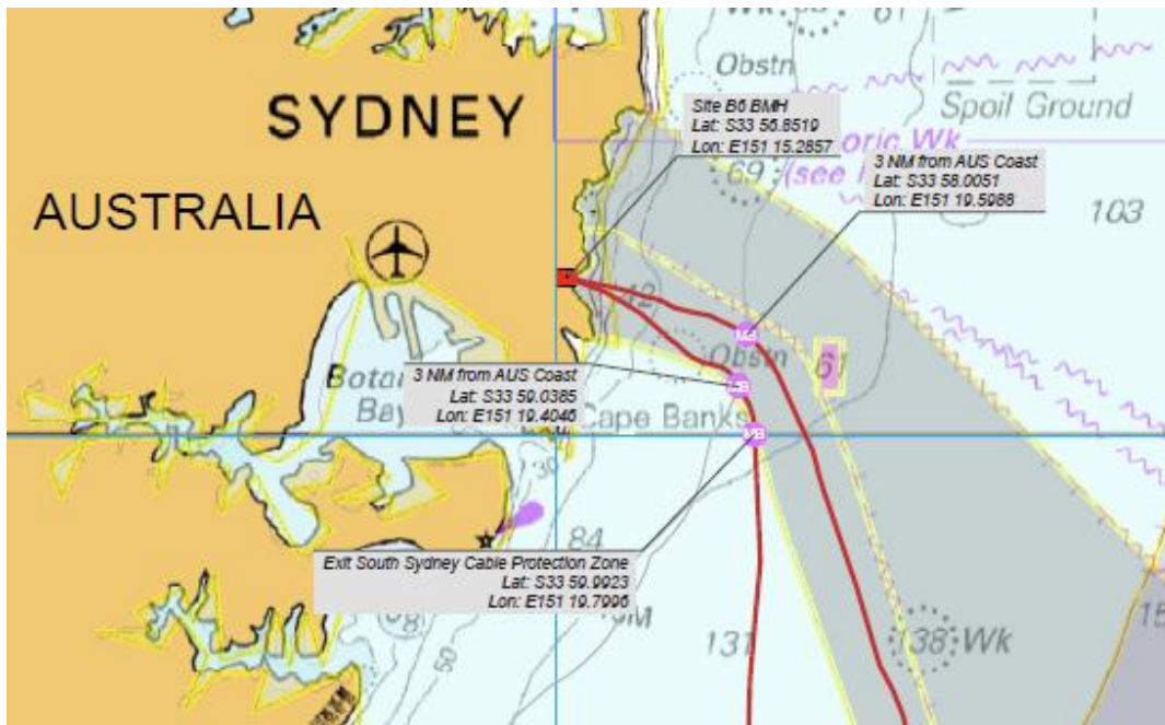
SubCom Campaign. Tabua and Honomoana cables.