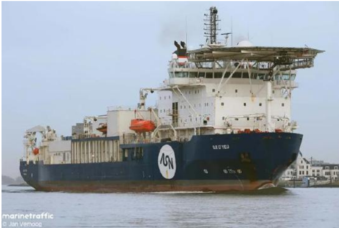
CS Ile d'Yeu