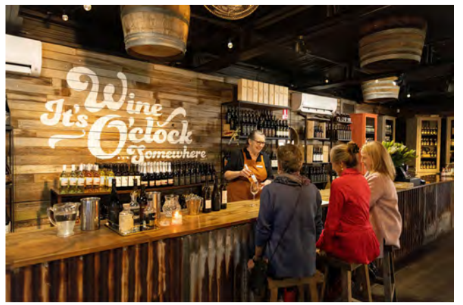
B Farm by Murrays