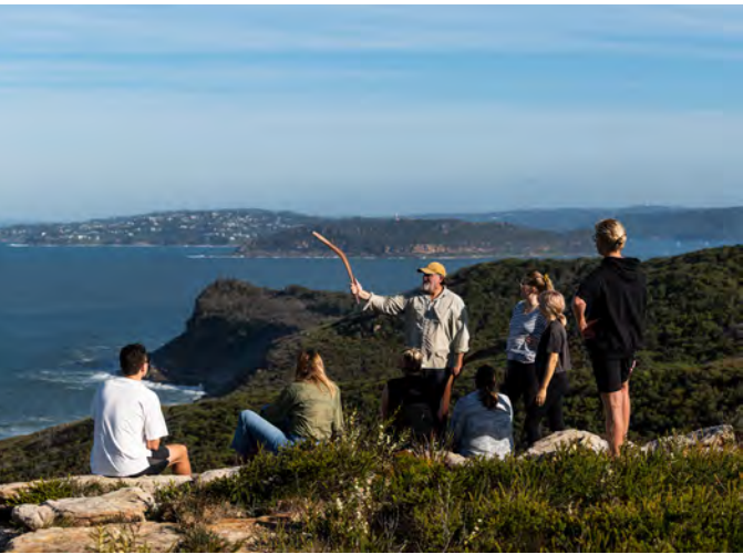
Girri Girra, Bouddi National Park