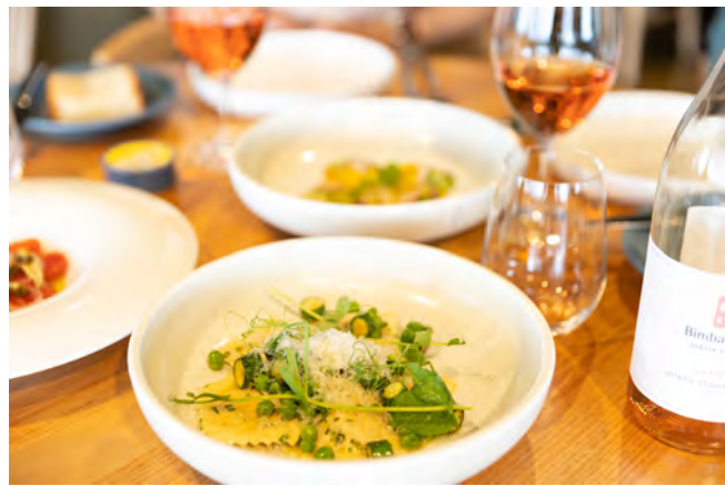
Esca Restaurant, Bimbadgen, Pokolbin - Credit: Hunter Valley Wine & Tourism Association

For more information: W: winecountry.com.au E: info@winecountry.com.au Shore excursion information: cruise@dssn.com.au