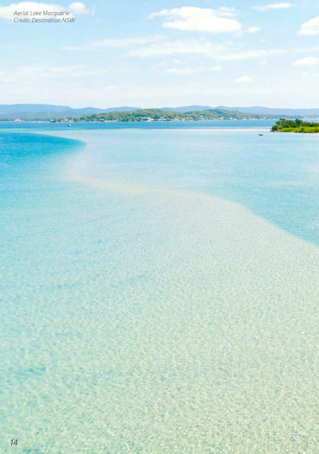
Aerial Lake Macquarie