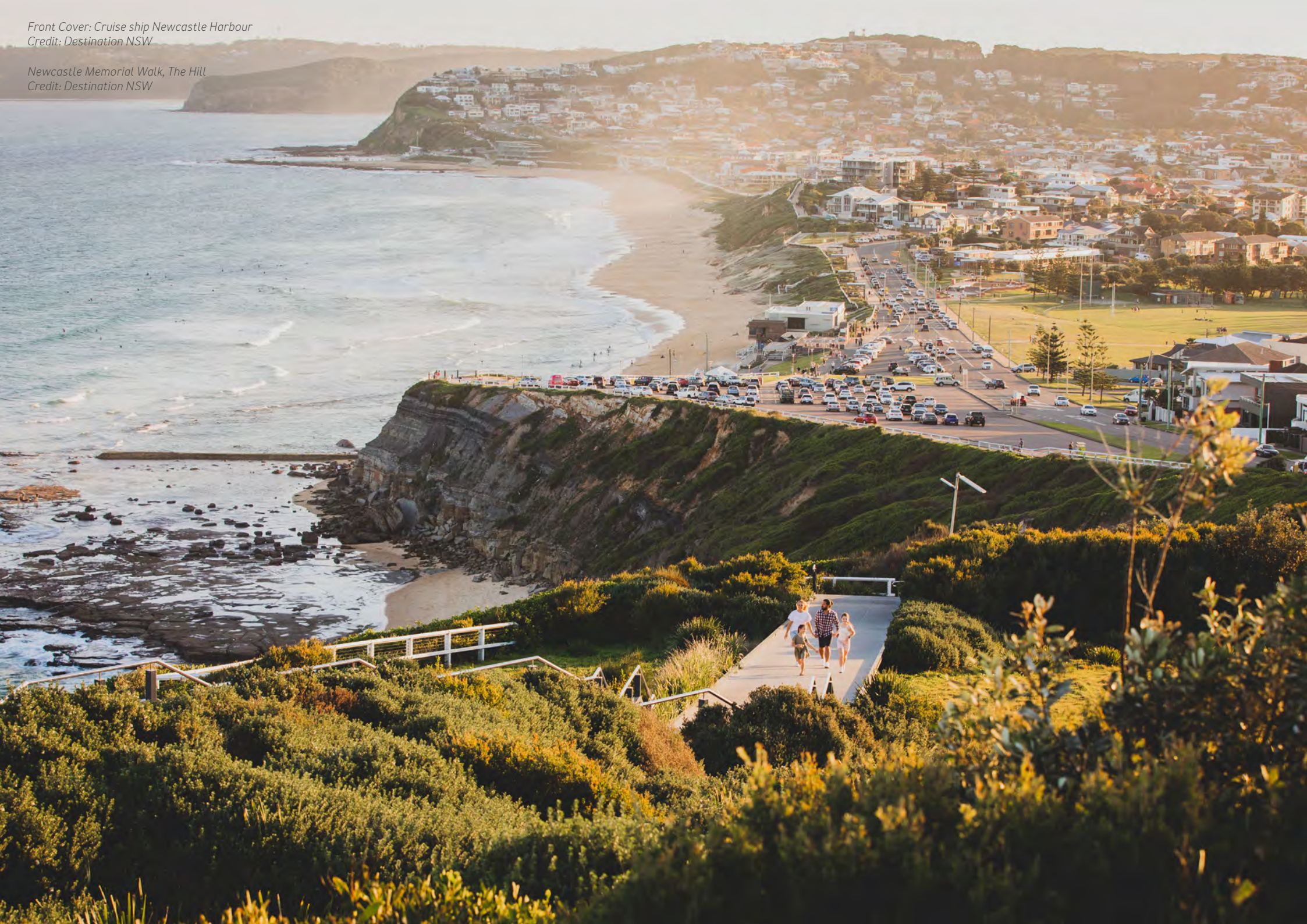
Newcastle Memorial Walk, The Hill