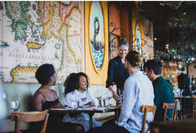
Rustica, Newcastle