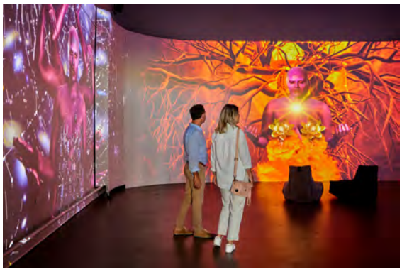
Multi-Arts Pavilion (Map mima), Lake Macquarie