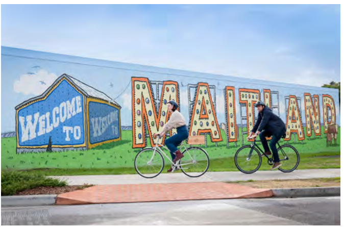
Streetscapes, Maitland