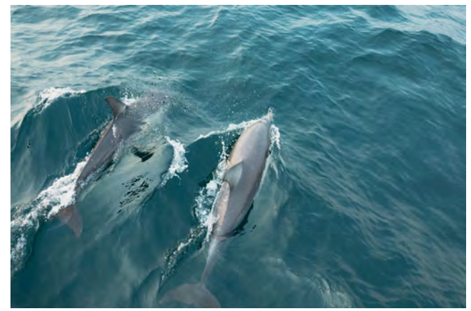
Dolphins, Port Stephens