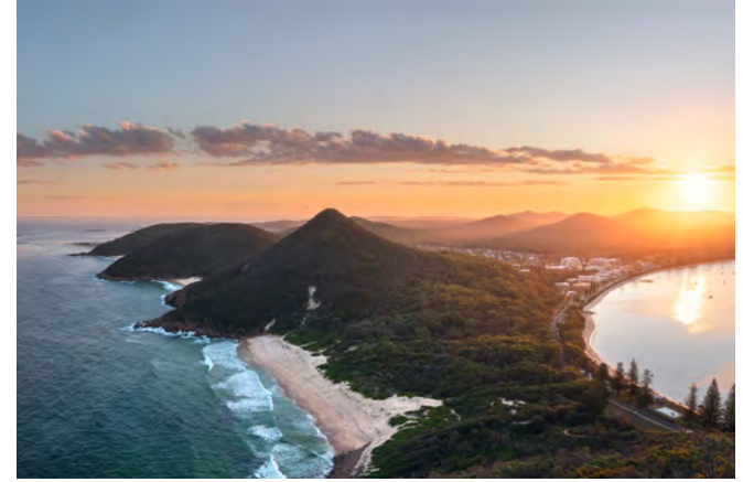
Tomaree Head Summit