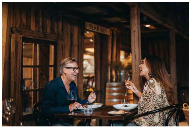
Boydell's, Morpeth - Credit: Maitland City Council