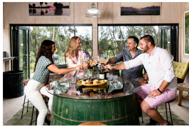
Winmark Wines, Broke