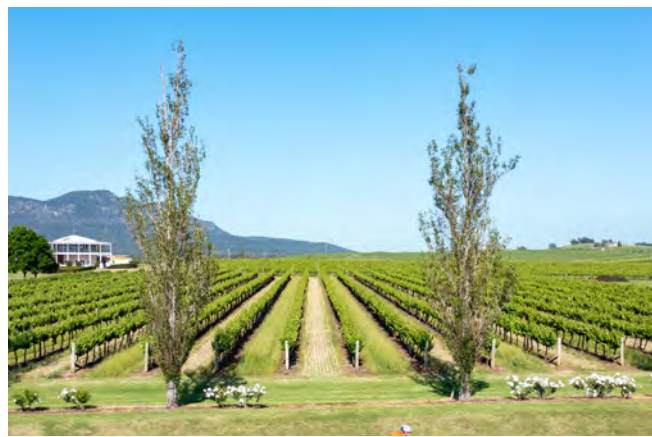
Hunter Valley Vineyards