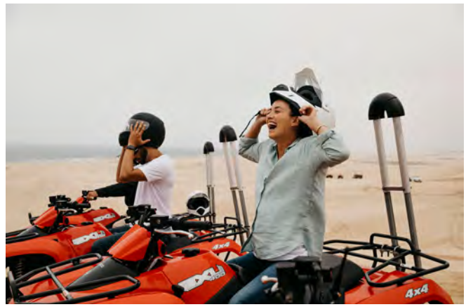
Stockton Sand Dunes in the Worimi Conservation Lands

For more information: W: portstephens.org.au E: info@portstephenstourism.com.au Shore excursion information: cruise@dssn.com.au