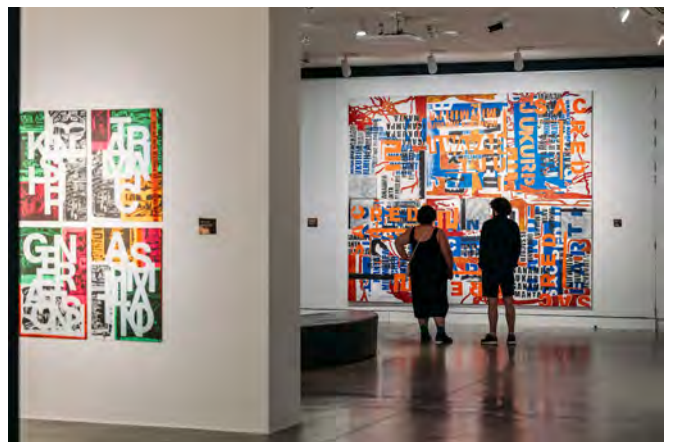
Maitland Regional Art Gallery