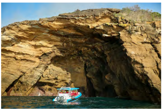
Coast XP, Lake Macquarie