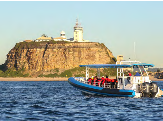
Coast XP Tours, Newcastle

For more information: W: visitnewcastle.com.au E: visitorinformation@ncc.nsw.gov.au Shore excursion information: cruise@dssn.com.au