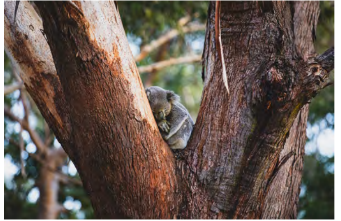
Port Stephens Koala Sanctuary