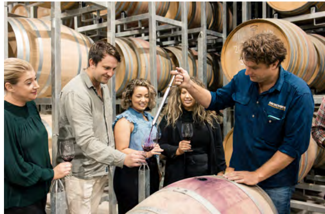
Brokenwood Winery, Pokolbin