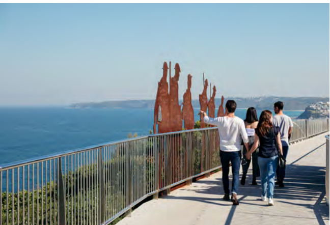
Newcastle Memorial Walk