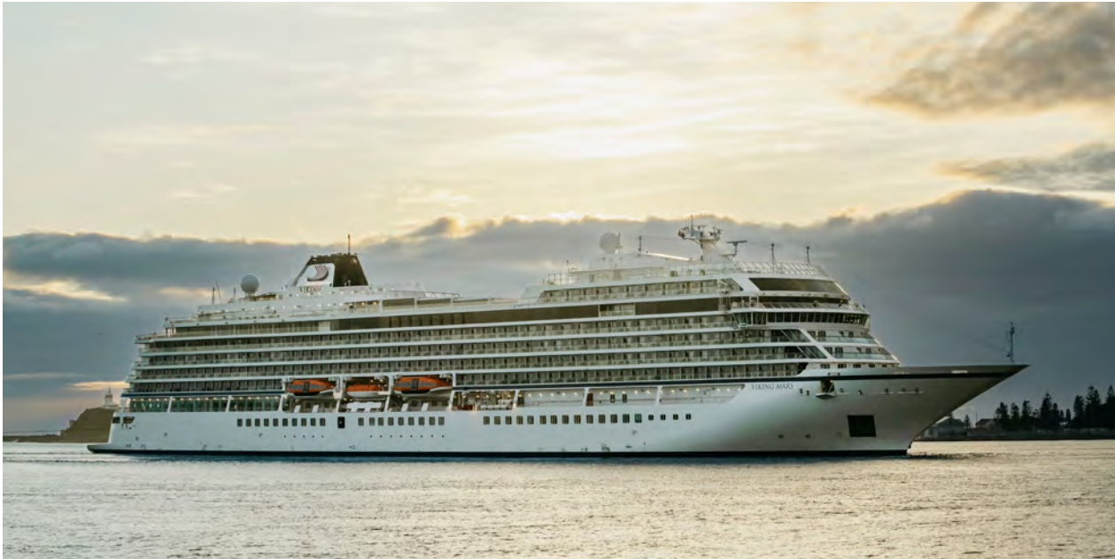
Cruise ship Newcastle Harbour