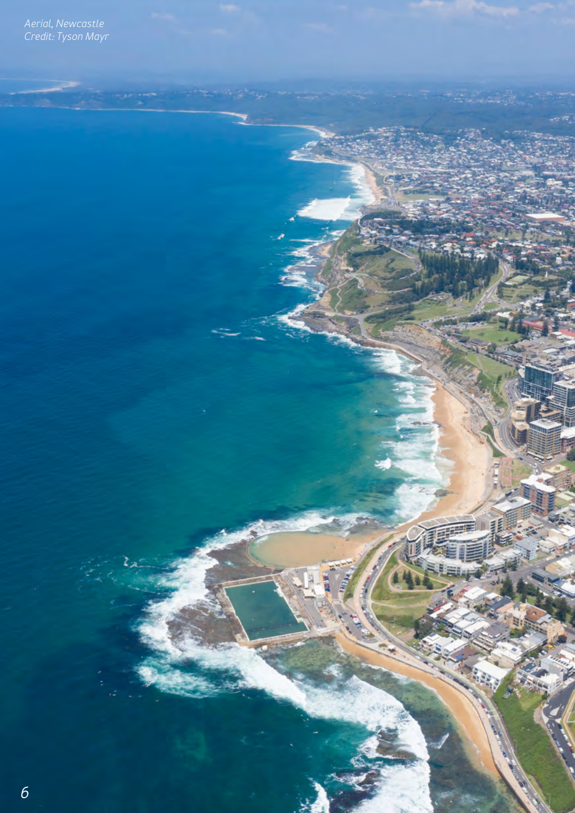
Aerial, Newcastle