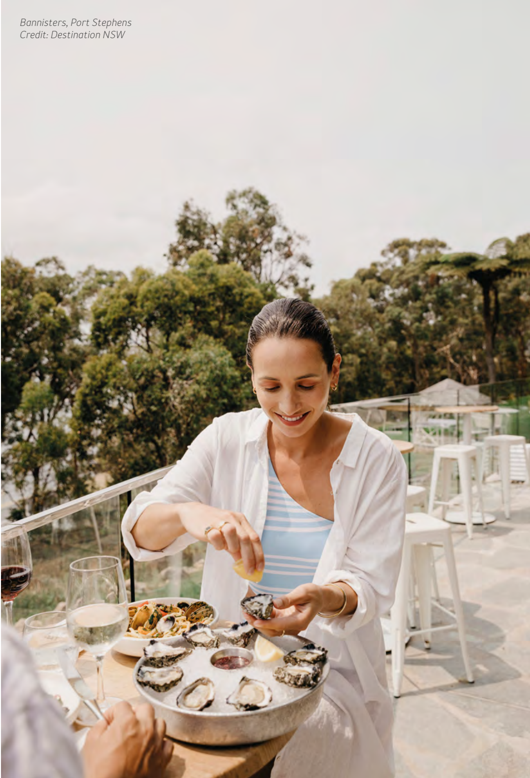
Bannisters, Port Stephens

Disclaimer: The details contained in the “Cruise Newcastle” brochure are presented in good faith and Destination Sydney Surrounds North (DSSN) has sought to ensure its contents are true, correct and based on the best available information at time of production. DSSN accepts no liability arising whatsoever from or in connection with the information contained in the “Cruise Newcastle” brochure. Some information contained in this publication has been provided by third parties and may be subject to change, modification, conditions and availability. DSSN acknowledges and appreciates all photographic images supplied for use in this brochure. The “Cruise Newcastle” brochure is copyright and cannot be reproduced without the prior written permission of DSSN.