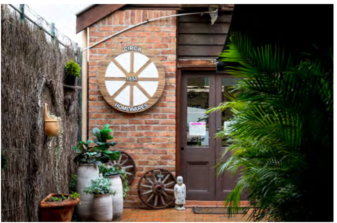
Crica 1950 Homewares, Morpeth