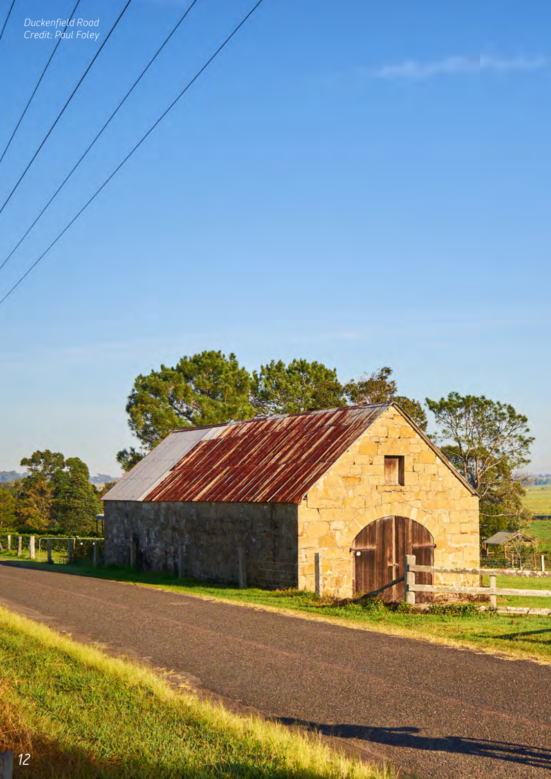
Duckenfield Road