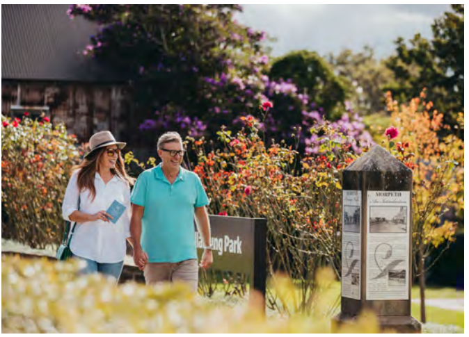
Illalung Park, Morpeth