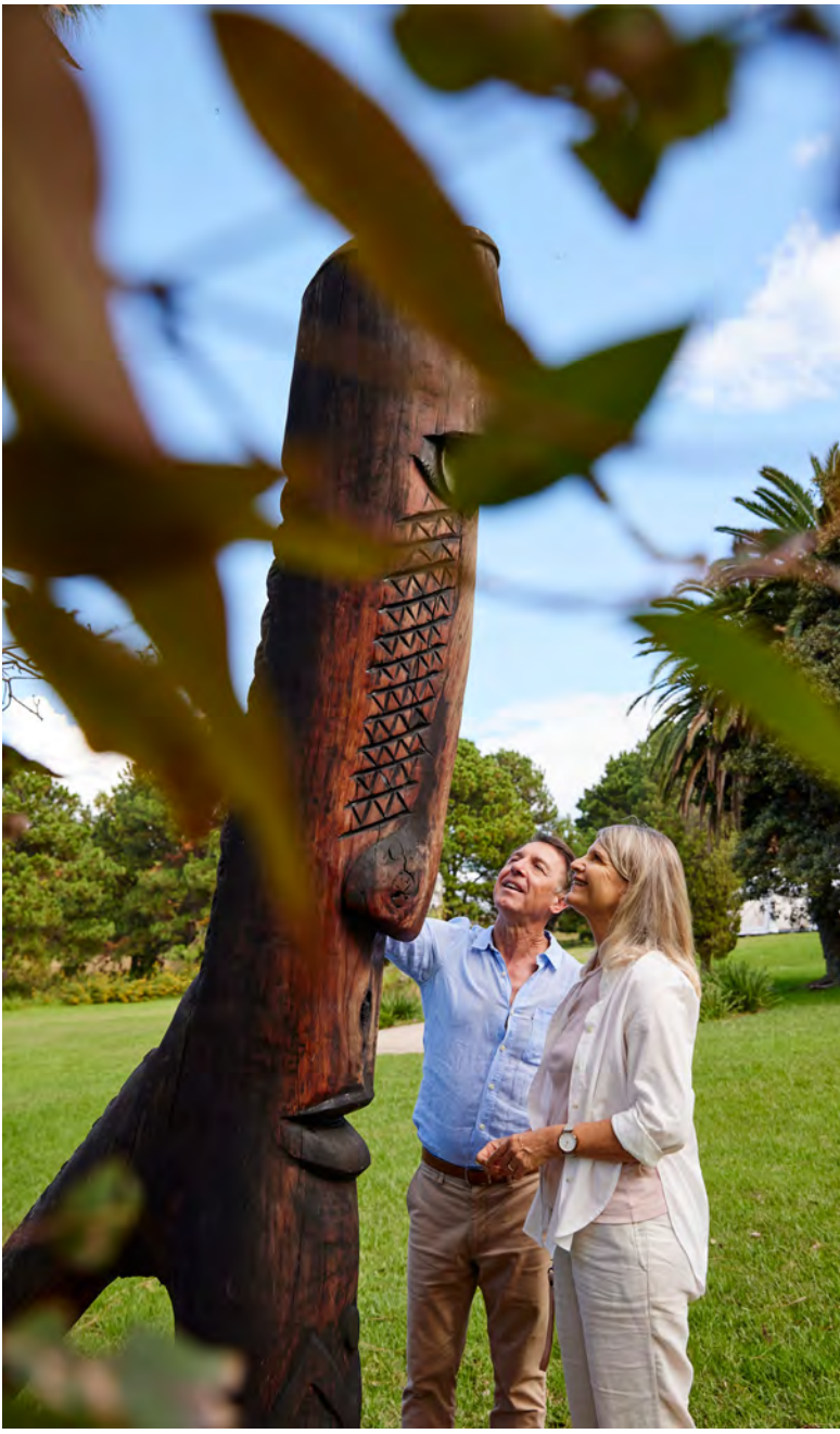
Museum of Art and Culture

For more information W: visitlakemac.com.au E: tourism@lakemac.nsw.gov.au Shore excursion information: cruise@dssn.com.au