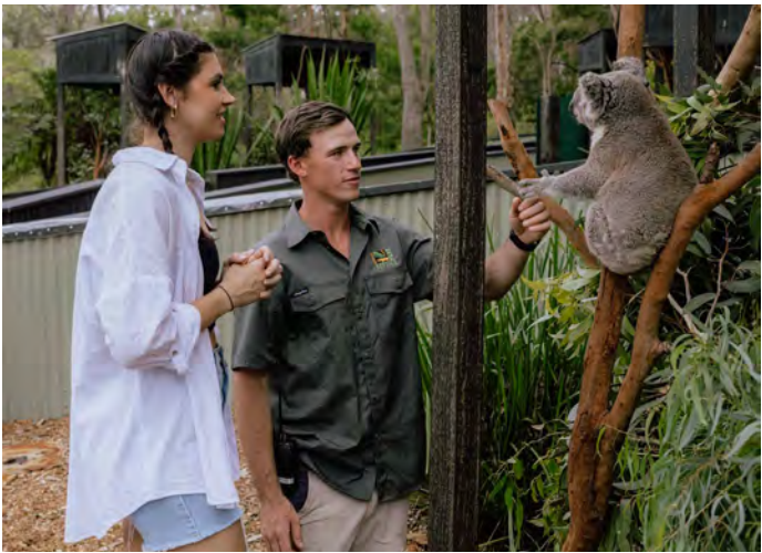
Australian Reptile Park

For more information: W: LoveCentralCoast.com or E: tourism@centralcoast.nsw.gov.au Shore excursion information: cruise@dssn.com.au