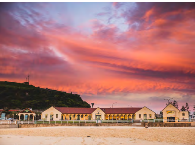
Nobbys Beach, Newcastle