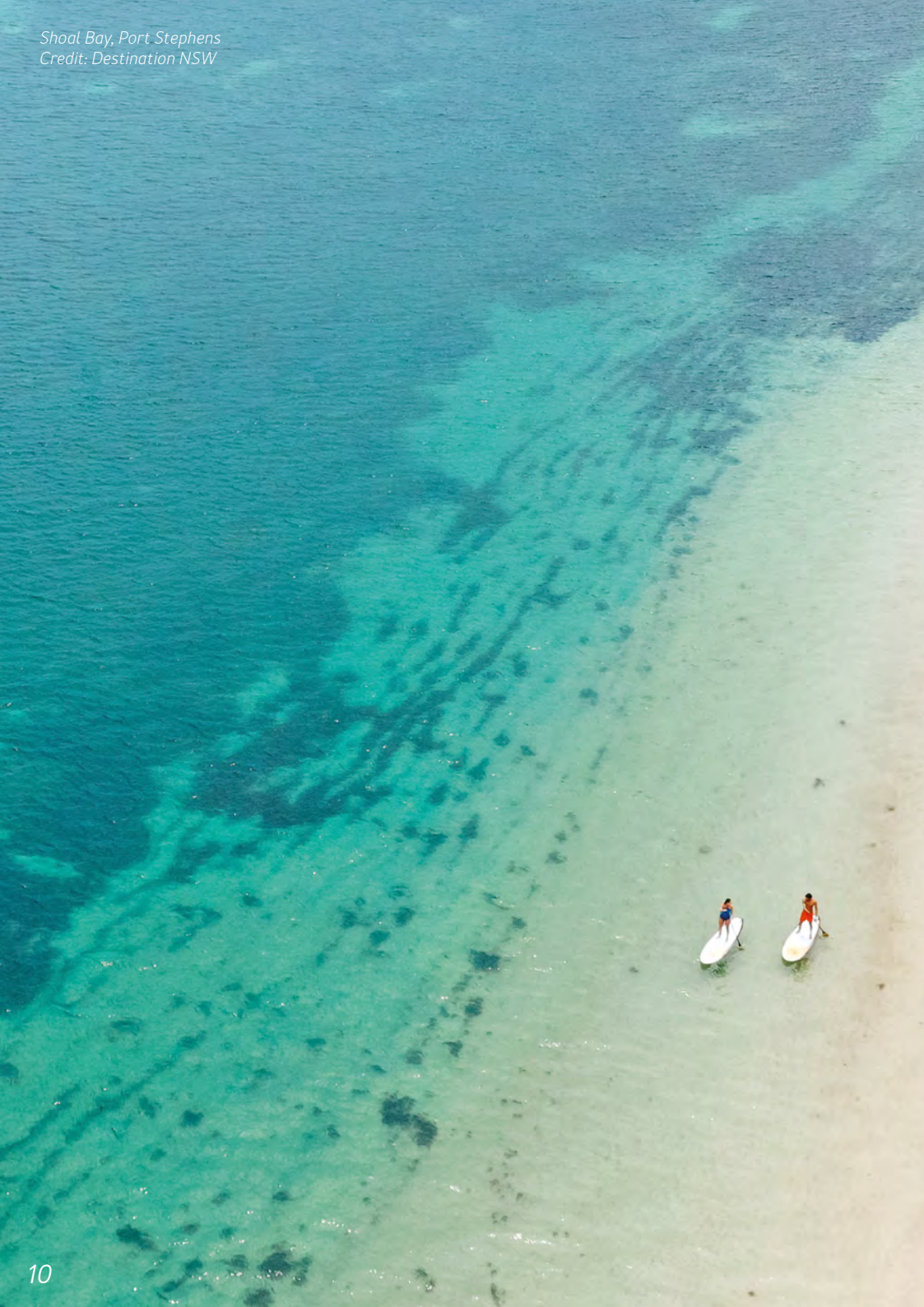
Shoal Bay, Port Stephens