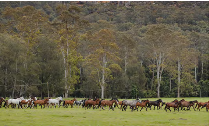
Glenworth Valley