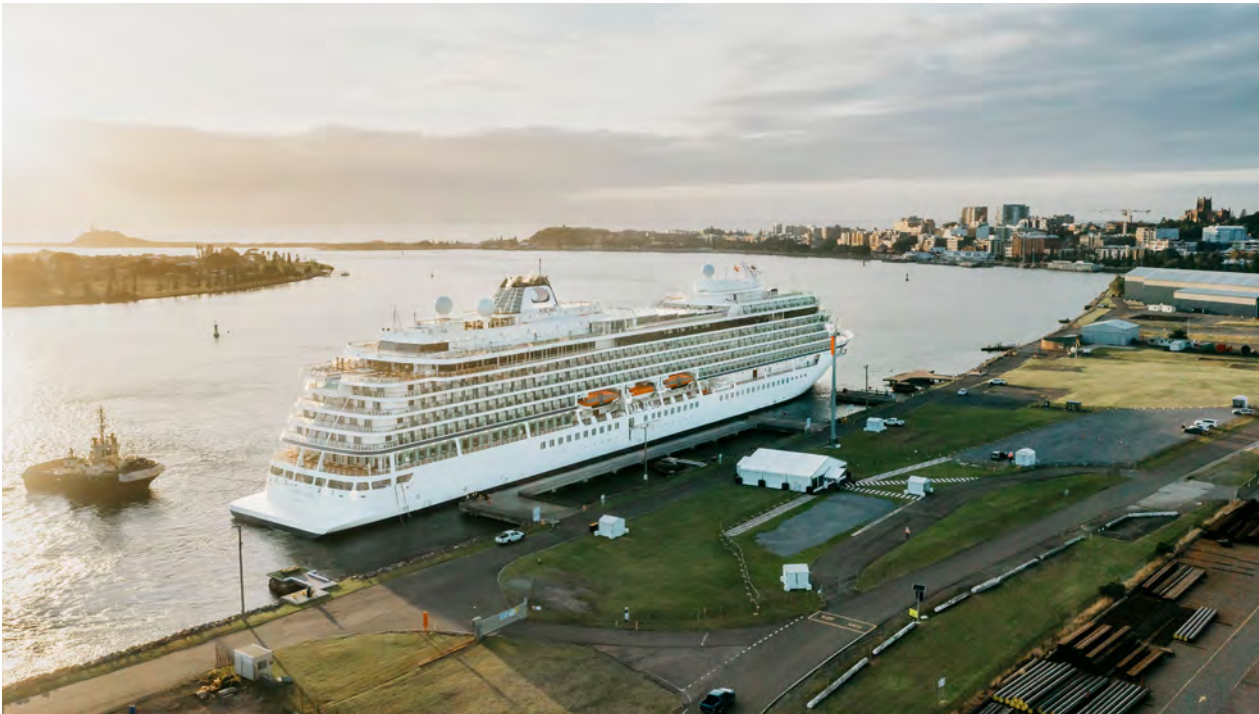
Cruise ship docked at the Newcastle Harbour