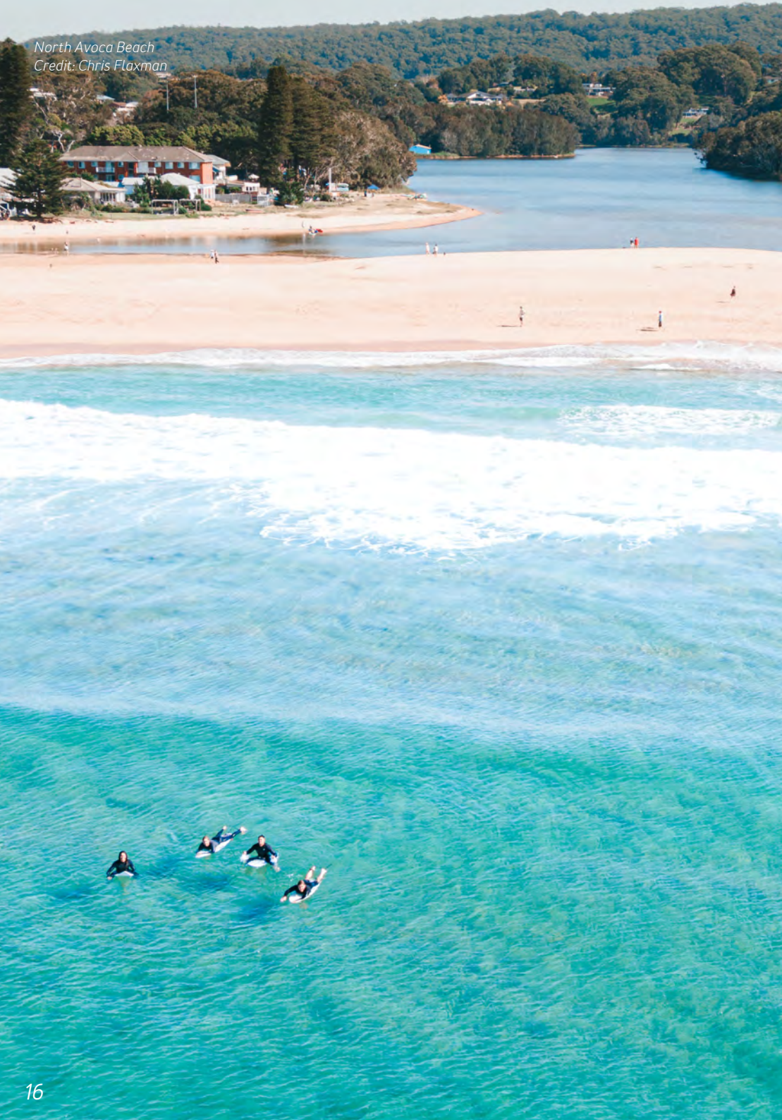
North Avoca Beach