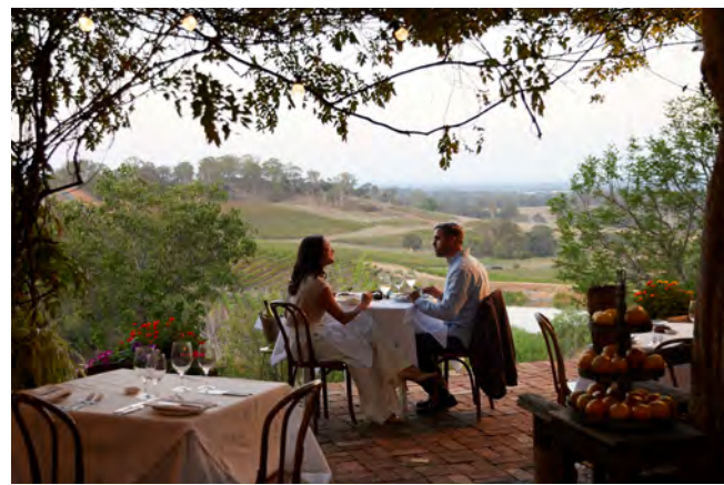
Bistro Molines, Mount View