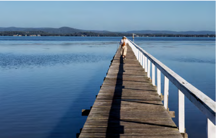
Long Jetty