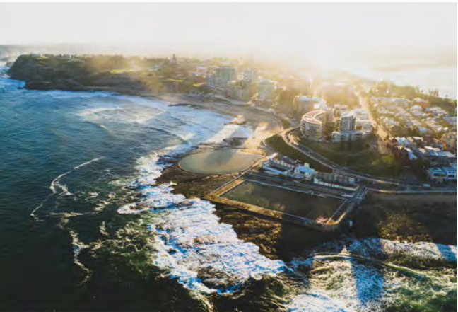
Newcastle Beach