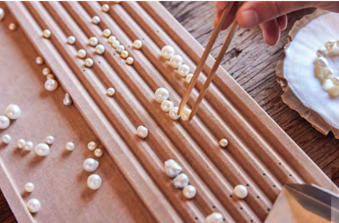
Broken Bay Pearl Farm, Mooney Mooney