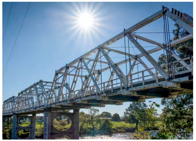
Morpeth Bridge

For more information W: mymaitland.com.au E: welcome@mymaitland.com.au Shore excursion information: cruise@dssn.com.au