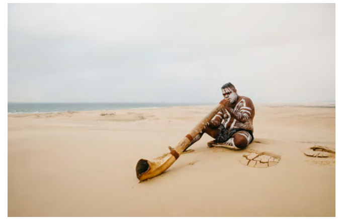
Stockton Dunes