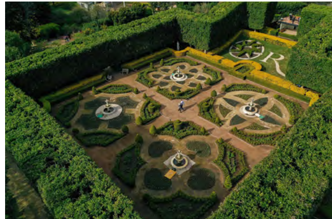
Hunter Valley Gardens