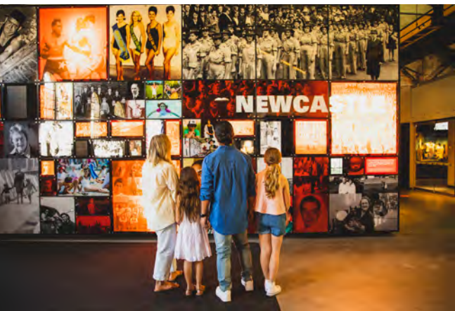
Newcastle Museum