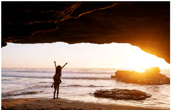
Caves Beach, Lake Macquarie - Credit: Destination NSW