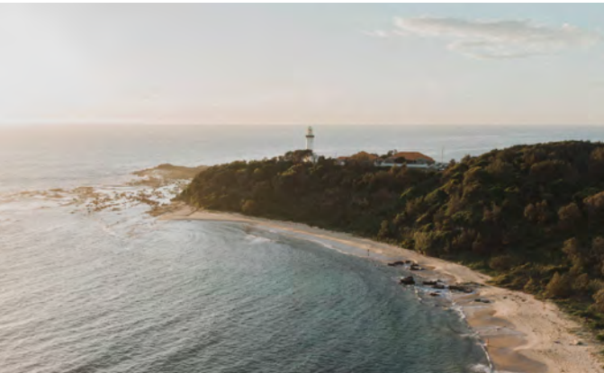
Norah Head Lighthouse