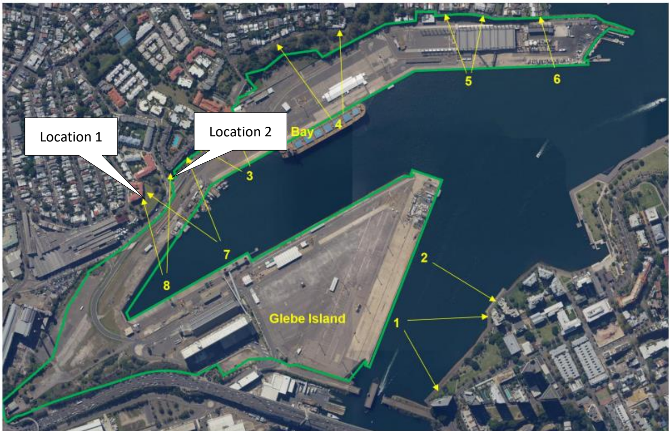
Figure 1 Location of berths and nearest receivers to each berth

Note: Figure referenced from Appendix H of the Port Noise Policy