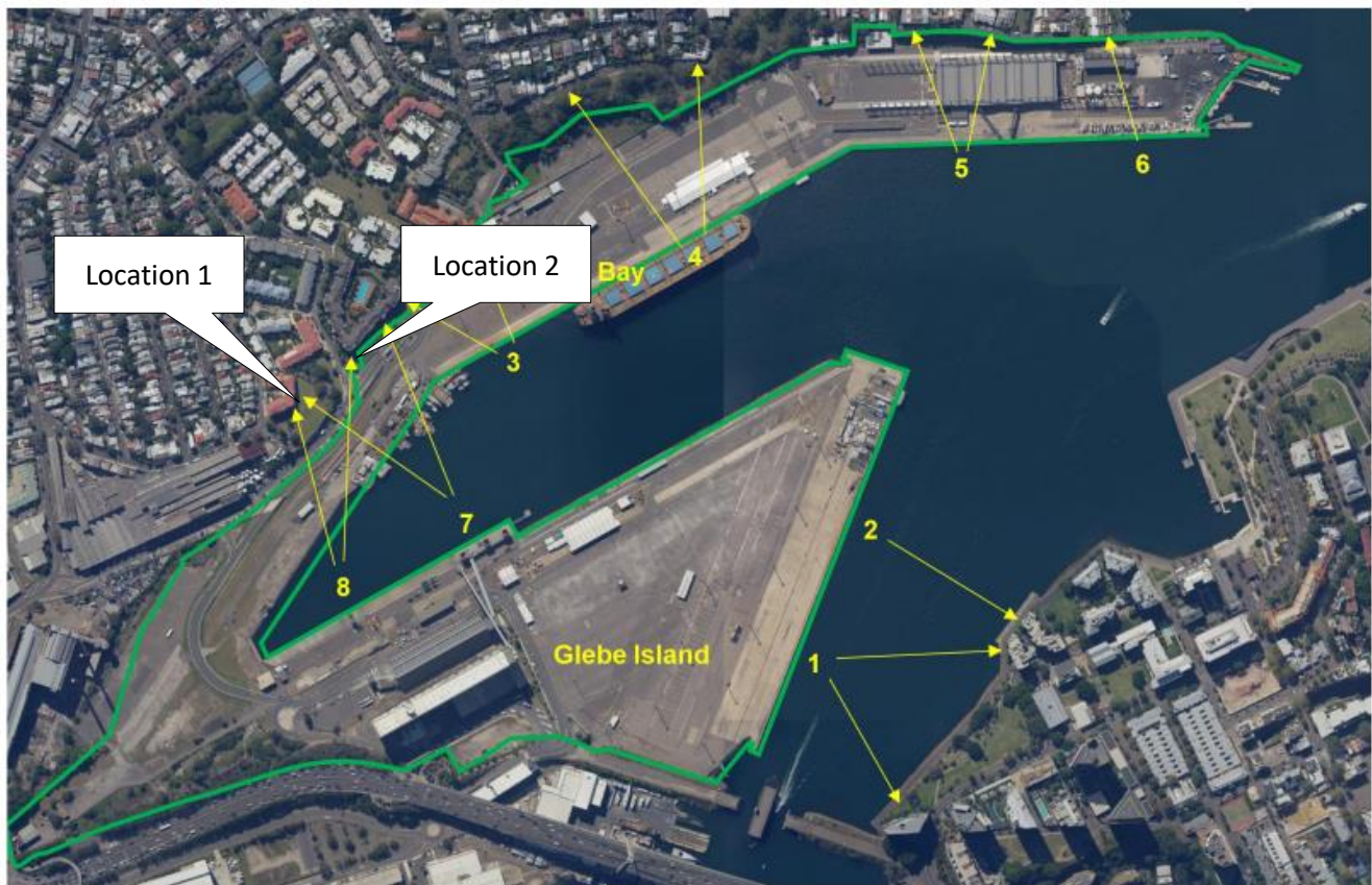
Figure 1 Location of berths and nearest receivers to each berth

Note: Figure referenced from Appendix H of the Port Noise Policy