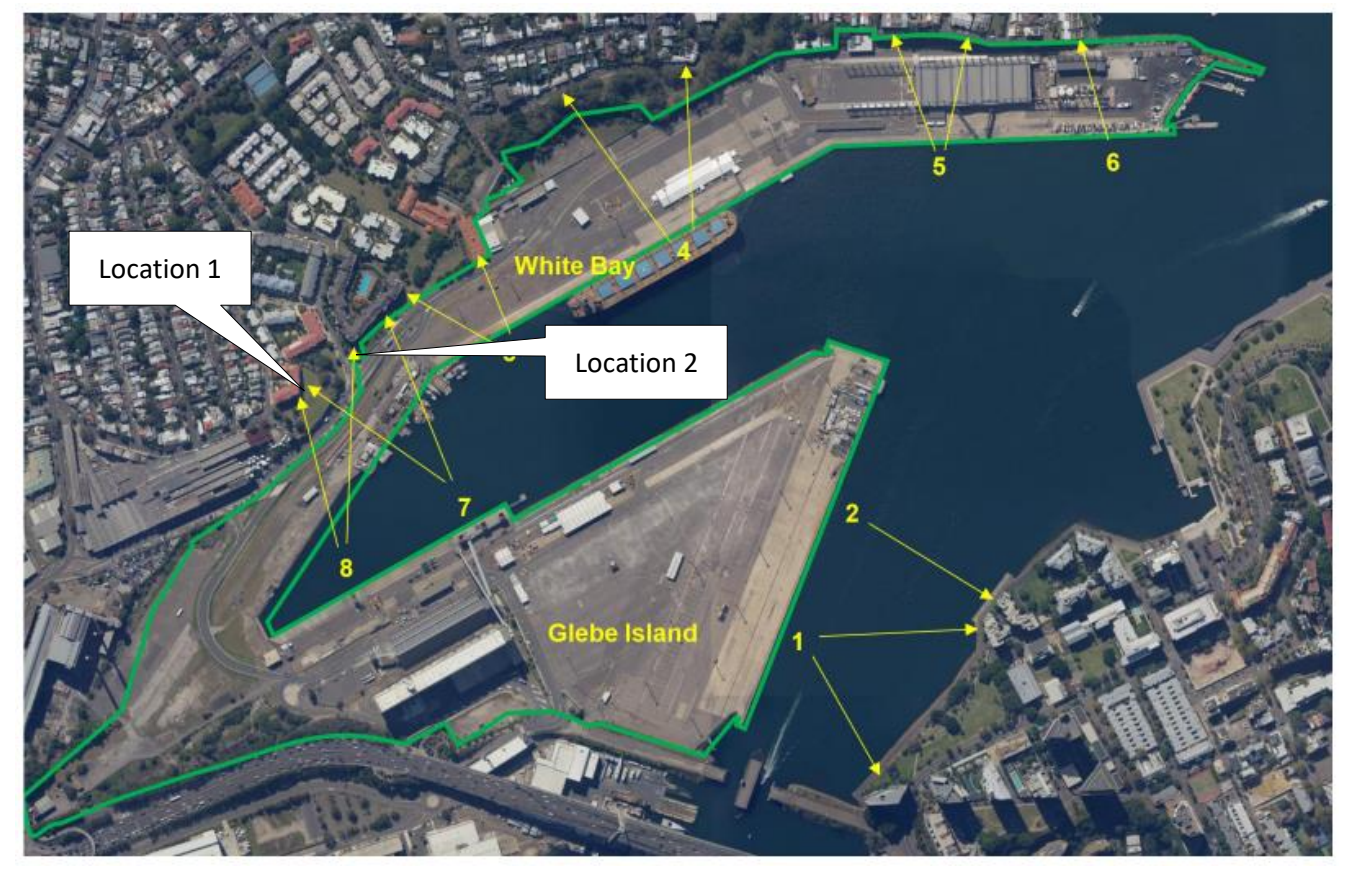
Figure 1 Location of berths and nearest receivers to each berth