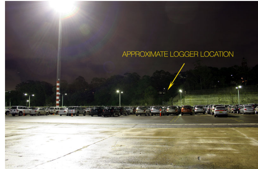
View from WB-4 deck towards 13 Donnelly Street