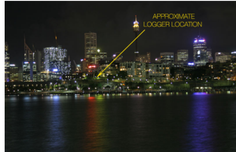
View from WB-4 deck towards 2 Point Street