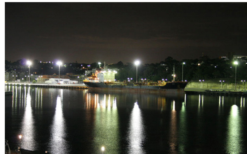
View from 2 Point Street towards the bulk liquids ship berthed at WB-4