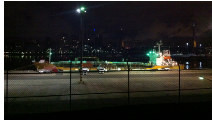
View from 13 Donnelly St towards the bulk liquids ship, berthed at WB-4