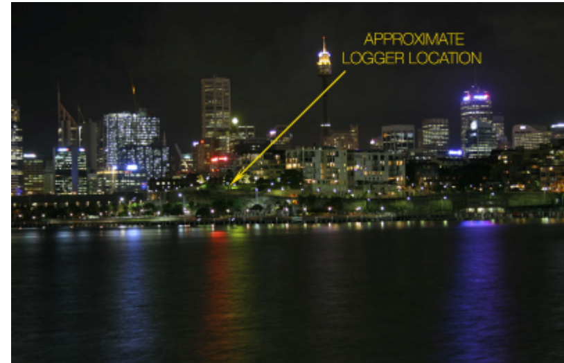
View from WB-4 deck towards 2 Point Street