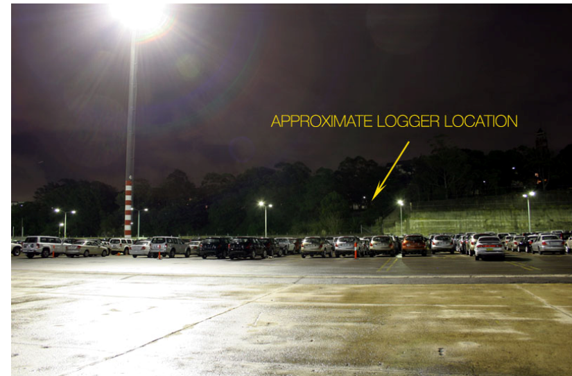
View from WB-4 deck towards 13 Donnelly Street