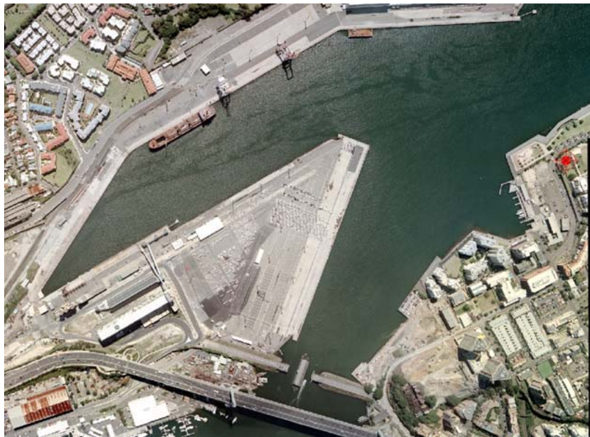
Aerial Photo showing the monitoring location at 2 Point Street, relative to White Bay Berth 4 (WB-4).

This monitoring location is situated approximately 660 m away from White Bay Berth 4 (across the bay). Monitoring was conducted at a height equivalent of a 5 storey building, on the cliffs edge. Pirrama Road encircles the park on the western, northern and eastern sides, approximately 15 m below.