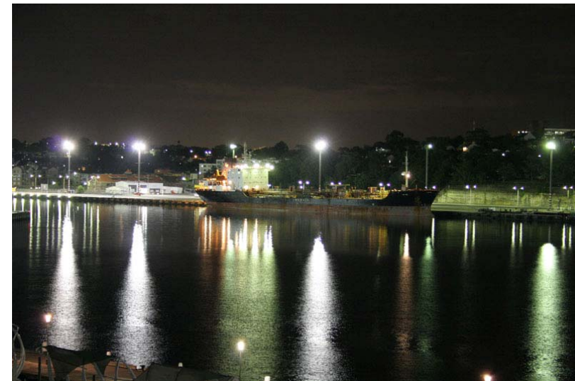
View from 2 Point Street towards the bulk liquids ship berthed at WB-4