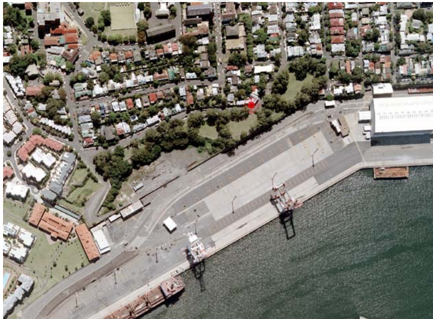
Aerial Photo showing the monitoring location at 13 Donnelly Street, relative to White Bay Berth 4 (WB-4).

The location is situated approximately 170 m away from and directly overlooking White Bay Berth 4 (across the park). It is elevated some 15 m above dock level. The measurement was conducted from street level (from a footpath) with Donnelly Street traffic less than 2 m away.