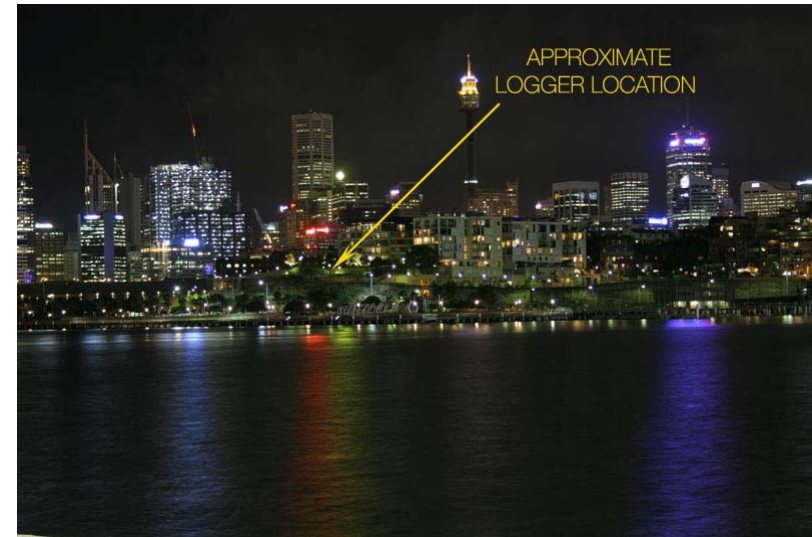
View from WB-4 deck towards 2 Point Street