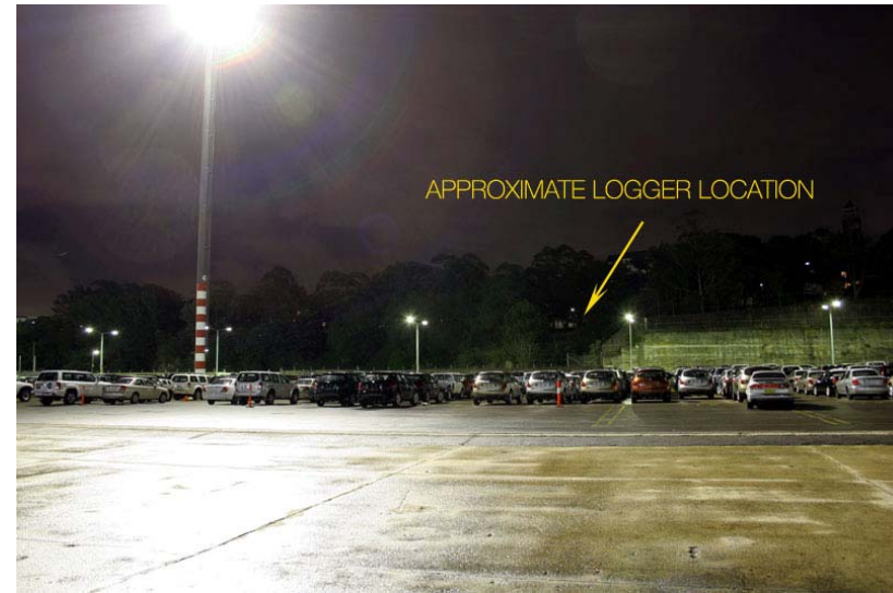
View from WB-4 deck towards 13 Donnelly Street