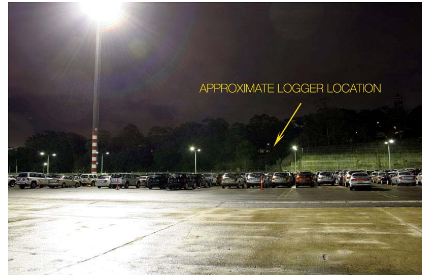
View from WB-4 deck towards 13 Donnelly Street