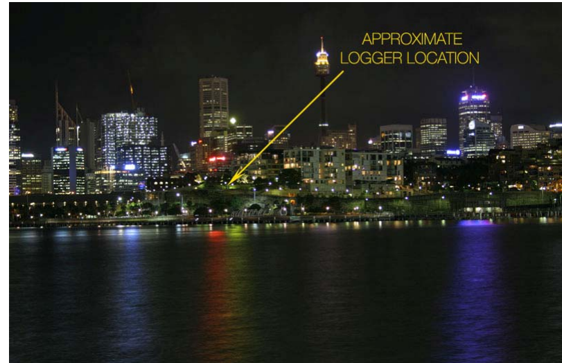
View from WB-4 deck towards 2 Point Street