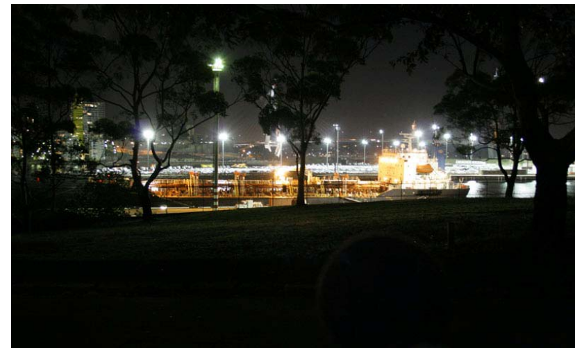
View from 13 Donnelly St towards the bulk liquids ship, berthed at WB-4