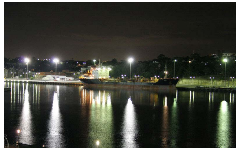
View from 2 Point Street towards the bulk liquids ship berthed at WB-4