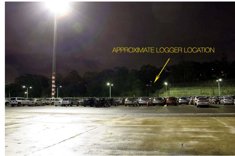
View from WB-4 deck towards 13 Donnelly Street