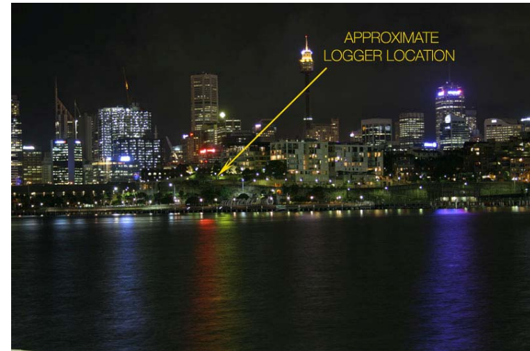
View from WB-4 deck towards 2 Point Street