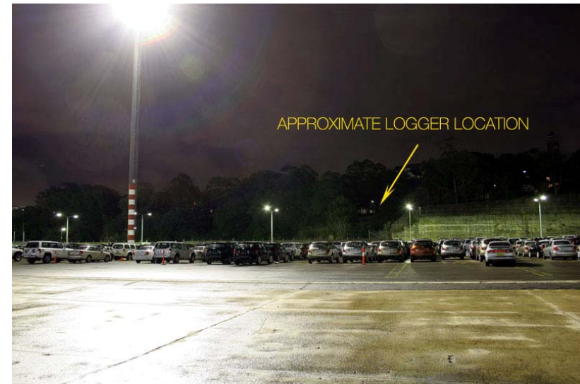
View from WB-4 deck towards 13 Donnelly Street