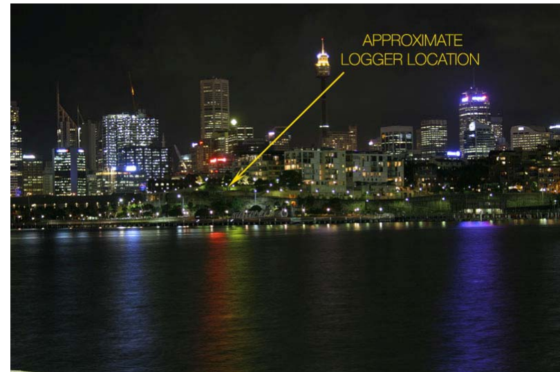
View from WB-4 deck towards 2 Point Street