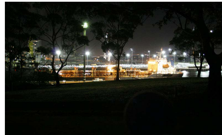
View from 13 Donnelly St towards the bulk liquids ship, berthed at WB-4