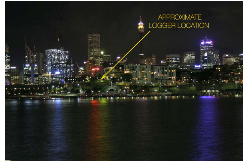
View from WB-4 deck towards 2 Point Street