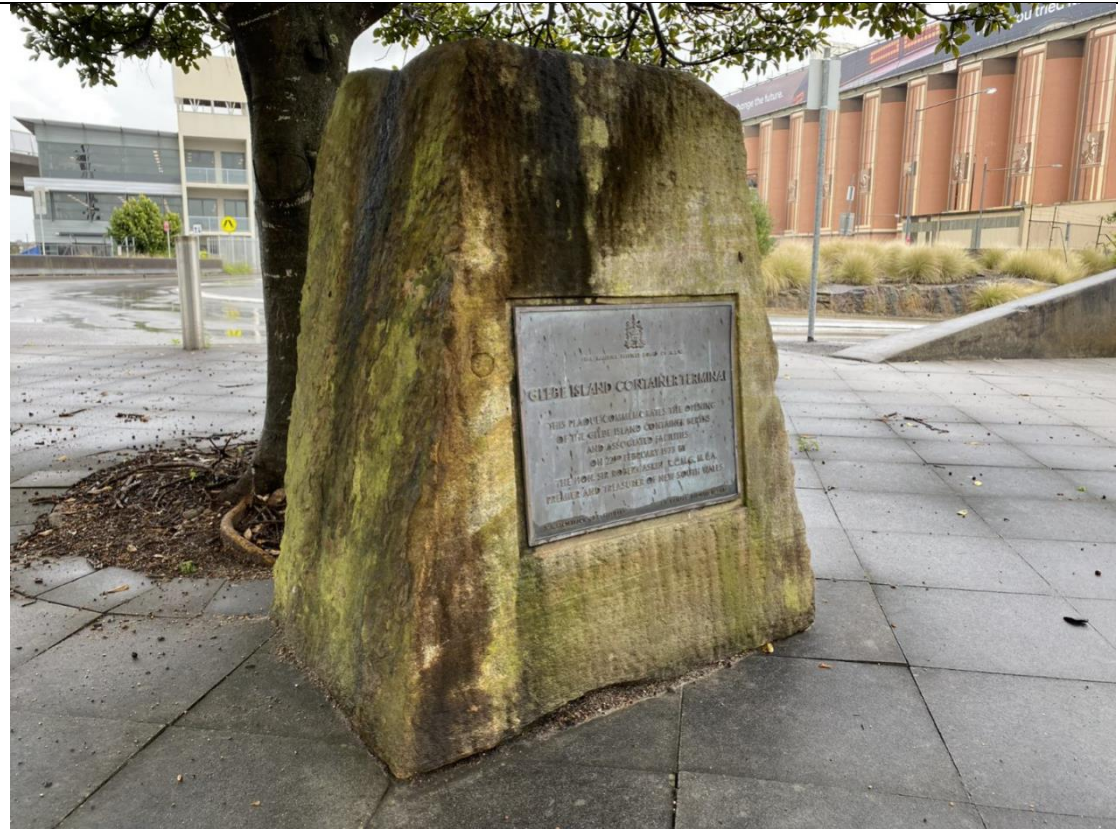
Caption: Glebe Island Plaque – Opening of Container Terminal - front