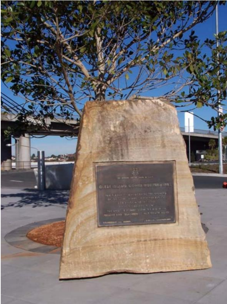
Caption: Glebe Island Plaque- Opening of Container Terminal