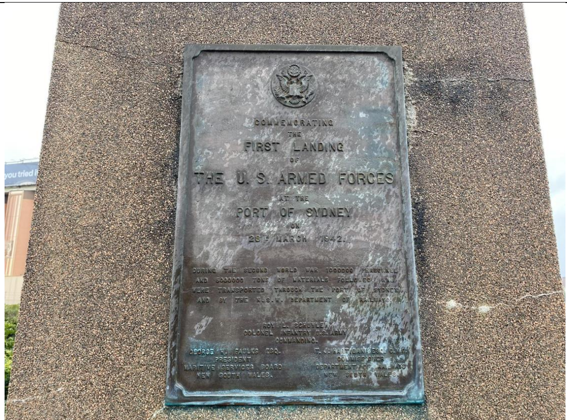
Caption: Close up of plaque on upper section of monument