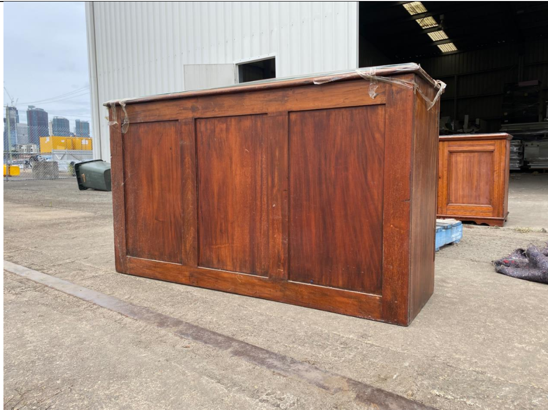
Caption: Timber cabinet with three paneled doors, rear profile, at Port Authority of NSW furniture shed, Glebe Island, Rozelle.