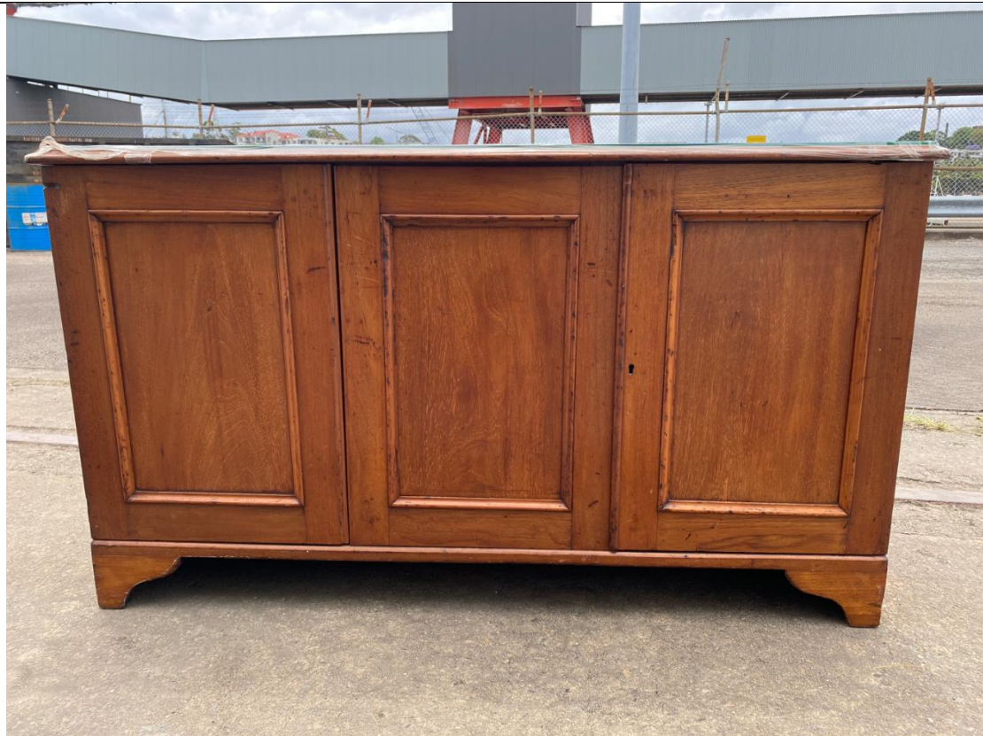
Caption: Timber cabinet with three paneled doors, front profile, at Port Authority of NSW furniture shed, Glebe Island, Rozelle.