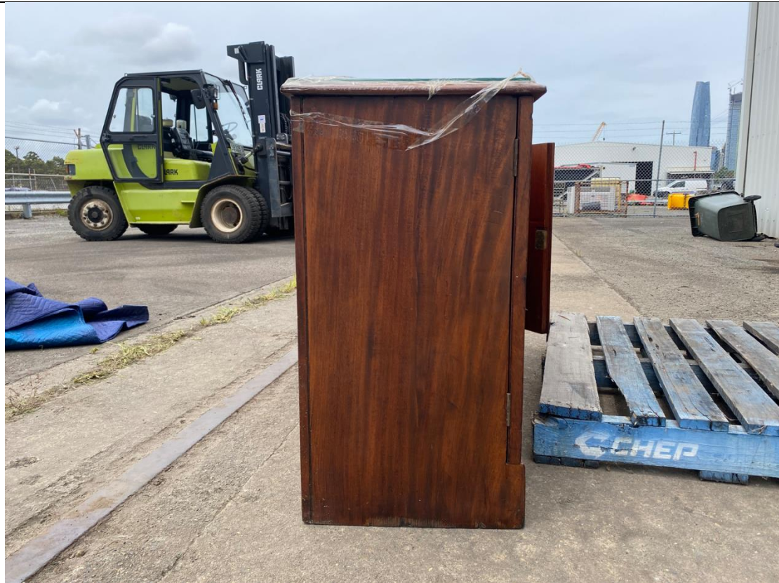
Caption: Timber cabinet with three paneled doors, side profile, at Port Authority of NSW furniture shed, Glebe Island, Rozelle.